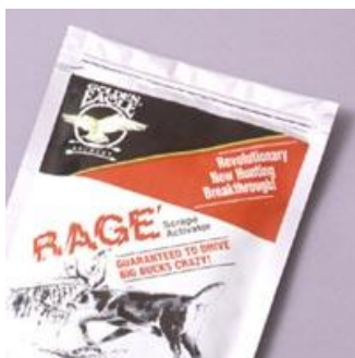
VF-48 white foil material for both pictures

Zipper bag - Two styles tamper evident or Non tamper evident bags. Tamper evident bags have an inch of header on the outside of the zipper; zipper is hermetically sealed. Product is loaded through the unsealed bottom of the bag. Non tamper evident bags are loaded through the zipper. OD dimensions include this header. For zippered bags there are 3/8+side seals. Opening of bag can also have 1/8+lip. Minimum quantities are 5,000 for unprinted, 10,000 for printed. Smaller quantities will be quoted for large bags.